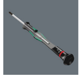
Multi-component screwdriver handle for ergonomic working.

The spherical drive profile means that it is possible to swivel the axis of the tool to that of the screw, and therefore enable angled, "around-the-corner" screwdriving jobs.