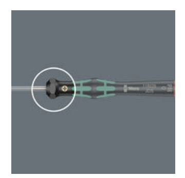
The precision zone directly above the blade gives the user a better feel for the right rotation angle during fine adjustment work.