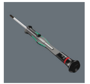
Multi-component screwdriver handle for ergonomic working.