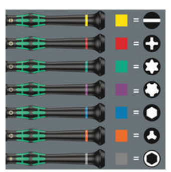
Screwdrivers with "Take it easy" tool finder: colour coding according to profile and size stamp.