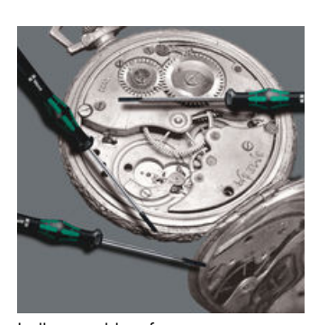
Indispensable for many users, including electronics technicians, opticians, precision engineers, jewellers, EDP hardware fitters and model-makers