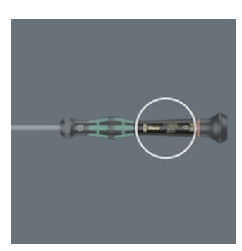
The fast-turning zone just below the rotating cap allows rapid twisting.