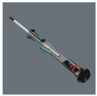
Multi-component screwdriver handle for ergonomic working.

Screwdriving jobs in electrical and precision engineering applications are often tedious and time-consuming. We learned from users what is important for them: working speeds, torque, precision - and we then focused particularly on these issues.