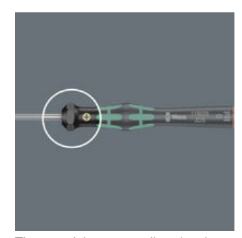
The precision zone directly above the blade gives the user a better feel for the right rotation angle during fine adjustment work.