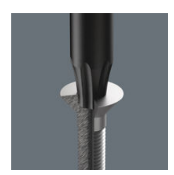
The Wera Black Point tip and a refined hardening process ensure long service life of the tip, improved corrosion protection and an exact fit.