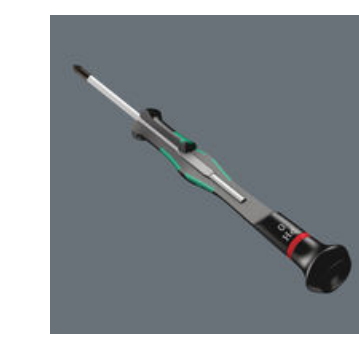
Multi-component screwdriver handle for ergonomic working.