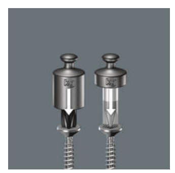
Wera Lasertip reduces the contact pressure required and enhances force transfer - meaning less screwdriving effort is required. Screwdriving becomes safer and easier.