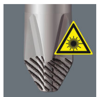
A precisely-focused laser creates a sharp-edged surface structure. Wera Lasertip "bites" itself into the screw head and prevents any slips out of the recess. It is available for screwdrivers for slotted, Phillips and Pozidriv screws.

It happens time and time again that the tip slips out of the screw head when screwdriving, sometimes damaging valuable surfaces or even causing injury. The tips of the Wera Lasertip screwdrivers are microscopically roughened by means of a laser. This rough surface literally "bites" itself firmly into the screw head. Slipping out becomes a thing of the past.