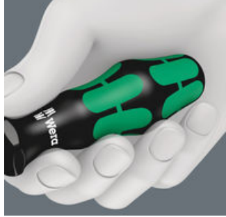
The outstanding design of the Kraftform handle that fits perfectly into the hand prevents hand injuries such as blisters and calluses.