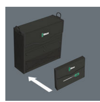
Suitable for docking with the Wera 2go system.