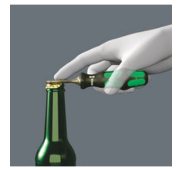
Plus iconic Wera bottle opener.