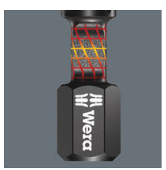
Torsion zone specially designed to absorb such forces and thereby protect the bit tip.