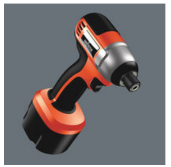
For use with impact screwdrivers. Improve productivity screwdriving with power tools.