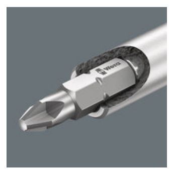
With stainless steel sleeve and strong permanent magnet.