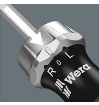
Additionally, the lockable neutral position permits exact adjustment work without having to change the screwdriving direction every time. Lockable neutral position for fine adjustment work.