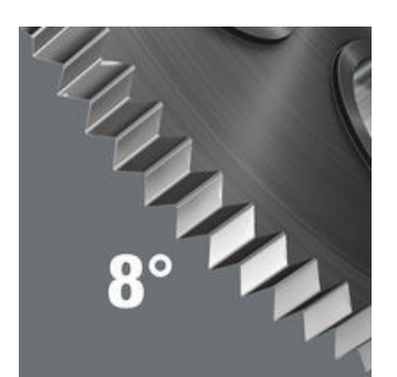
Fine action 44 tooth system for precision work. Great time savings when screwdriving.