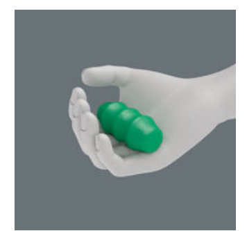
The basic idea for the prototype of the Kraftform handle - that the hand should dictate the design has, right through to today, proved to be correct. In cooperation with the internationally recognised Fraunhofer IAO Institute, Wera developed a screwdriver handle designed to match the shape of the human hand as long ago as 1960s. After a long the development phase, the Wera Kraftform handle was launched to the market in 1968. It has been optimised through the years with new technologies, but has kept its proven shape. After all, the human hand has not changed either.