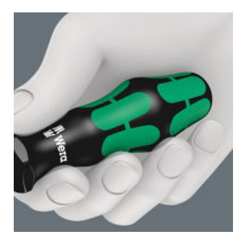
The outstanding design of the Kraftform handle that fits perfectly into the hand prevents hand injuries such as blisters and calluses.