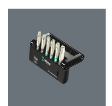
The Bit-Checks can be positioned upright at the workplace so the tool is always quickly to hand.