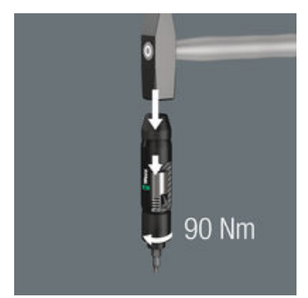
The double-curved design is particularly efficient.