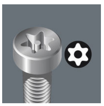
TORX® tools with a borehole prevent the unauthorised unfastening of safety screws. The screws contain a pin that protrudes into the drive profile so that "normal" TORX® tools cannot be used. This pin fits into the borehole of TORX® BO tools allowing safety screws to be unfastened.