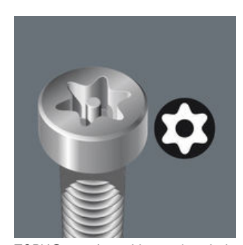
TORX® tools with a borehole prevent the unauthorised unfastening of safety screws. The screws contain a pin that protrudes into the drive profile so that "normal" TORX® tools cannot be used. This pin fits into the borehole of TORX® BO tools allowing safety screws to be unfastened.