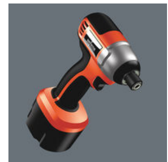
For use with impact screwdrivers. Improve productivity when screwdriving with power tools.