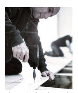
Impaktor technology for an aboveaverage service life even under extreme demands