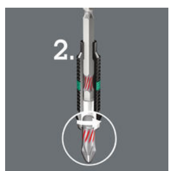
Higher peak loads are minimised through the torsion effect of the bit shaft (Phase 2).