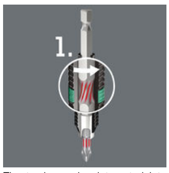
The torsion spring integrated into the unique BiTorsion holder absorbs lower levels of peak loads (Phase 1). Any overloading of this spring is effectively prevented by means of a supporting mechanism.