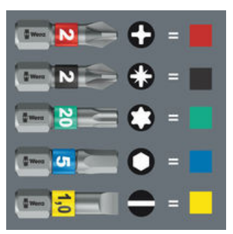
The "Take it easy" Bit-Checks have bits with a sleeve which from its colour (e.g. red = Phillips) and size designation - make it simple to access the right bit quickly.