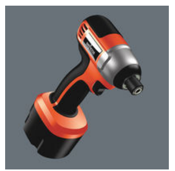
For use with impact screwdrivers. Improve productivity when screwdriving with power tools.

For an above-average service life. Maximum utilisation of the material properties, a very special geometry - designed particularly to meet the extreme demands - as well a specific manufacturing process mean that Wera Impaktor tools have an above-average service life. Another product advantage is the coating of the Impaktor bits with minute diamond particles. These diamond particles reduce the cam-out effects particularly high in power tool applications - which can lead to a slipping out of the screw head. The diamond particles literally bite themselves into the screw recess. This means that less contact pressure is required, something that greatly delays fatigue settingin in power tool screwdriving jobs.