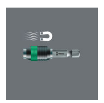
Bitholders, magnetic, for easier application of the screw