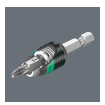
Rapid bit change without needing any additional tools. One-hand operation with a freely spinning sleeve for simplified guidance of the tool.