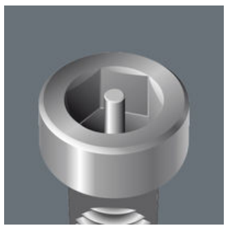
For hexagon socket screws with safety pin.

Further versions in this product family: