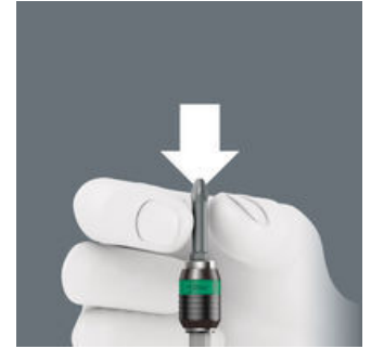
Rapid-in and self-lock

The bit can be pushed into the adaptor without moving the sleeve. The lock is activated automatically as soon as the bit is applied to the screw. Bits are held securely and wobble-free.