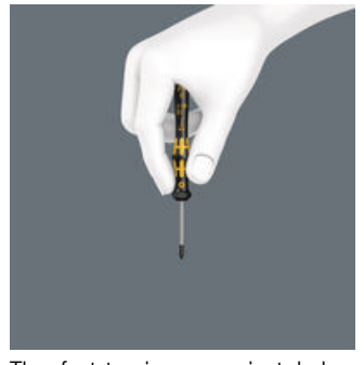
The fast-turning zone just below the rotating cap allow rapid twisting. This makes timeconsuming grip adjustments as with other conventional precision screwdrivers unnecessary.