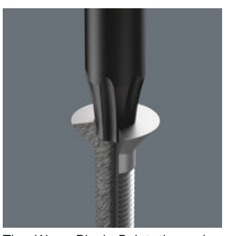
The Wera Black Point tip and a refined hardening process ensure long service life of the tip, improved corrosion protection and an exact fit.