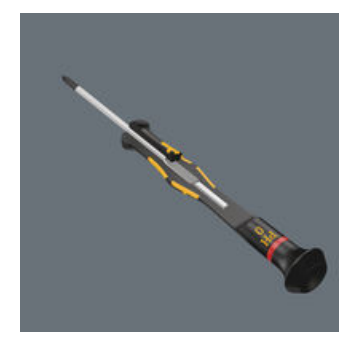
Multi-component screwdriver handle for ergonomic working.