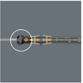
The precision zone directly above the blade gives the user a better feel for the right rotation angle during fine adjustment work.