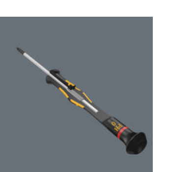
Multi-component screwdriver handle for ergonomic working.