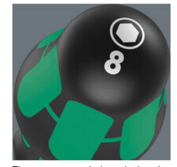
The screw symbol and tip size identification markings on the handle make it easier to find the right screwdriver in the tool case, or at the workplace.