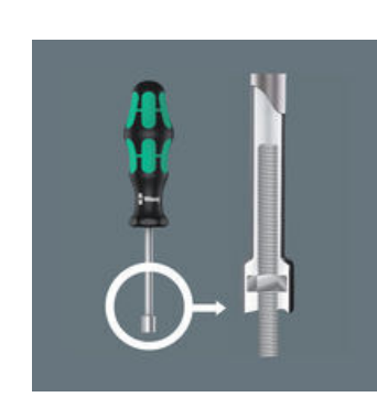
A screwdriver with a hollow shaft is needed whenever there are screwdriving jobs involving threaded rods i.e. the threaded rod through the nut can slip into the hollow shaft of the screwdriver.