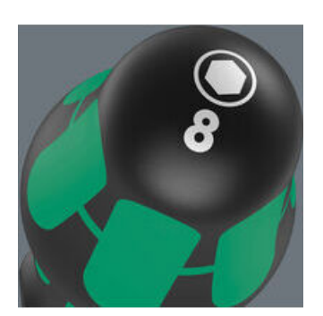
The screw symbol and tip size identification markings on the handle make it easier to find the right screwdriver in the tool case, or at the workplace.

Web link https://products.wera.de/en/screwdrivers_kraftform_plus__series_300_395_ho.html