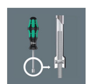
A screwdriver with a hollow shaft is needed whenever there are screwdriving jobs involving threaded rods i.e. the threaded rod through the nut can slip into the hollow shaft of the screwdriver.