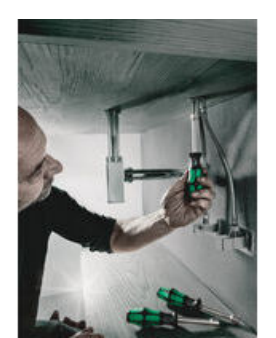
Hollow shaft for protruding threaded rods