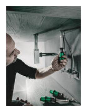
shaft Hollow for protruding threaded rods