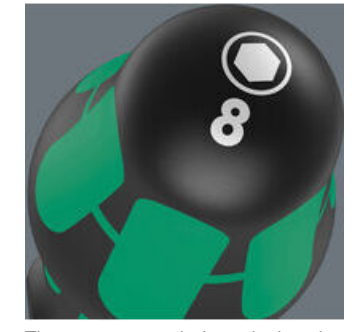
The screw symbol and tip size identification markings on the handle make it easier to find the right screwdriver in the tool case, or at the workplace.