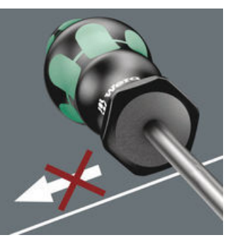
The hexagonal non-roll feature prevents any rolling away at the workplace.