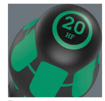
The screw symbol and tip size identification markings on the handle make it easier to find the right screwdriver in the tool case, or at the workplace.