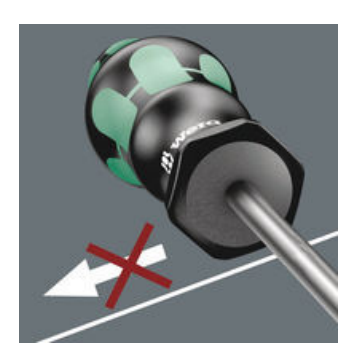
The hexagonal non-roll feature prevents any rolling away at the workplace.