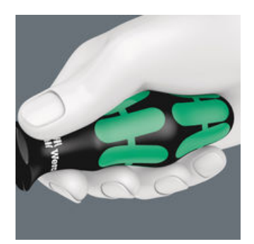
The large contact area - with particularly high friction to the soft zones - results in high torque transfer without any bruising from the edges.