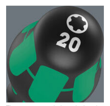
The screw symbol and tip size identification markings on the handle make it easier to find the right screwdriver in the tool case, or at the workplace.