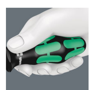
The large contact area - with particularly high friction to the soft zones - results in high torque transfer without any bruising from the edges.