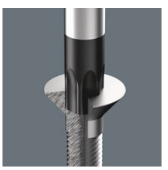
The Wera Black Point tip and a refined hardening process ensure long service life of the tip, improved corrosion protection and an exact fit.