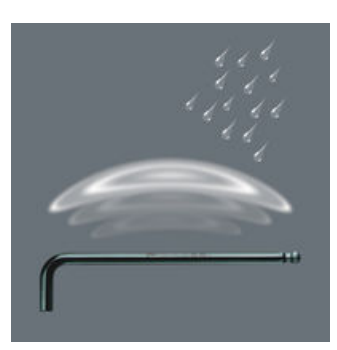
L-keys with BlackLaser surface treatment for outstanding surface protection and long service life. High corrosion protection.