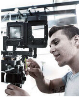
Holding function for recessed TORX® screws