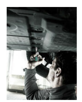
The 411 A RA T-handle is suitable for 1/4" sockets. The sockets are securely locked via the ball.