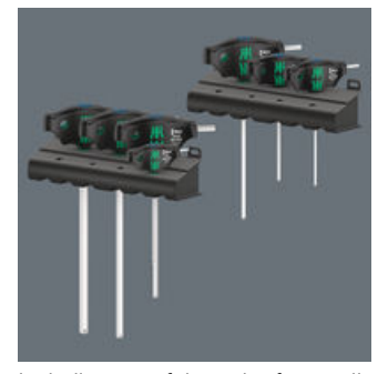
Including useful rack for wellarranged storage of the screwdrivers.