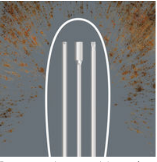
Due to the special surface treatment, the blades receive a high level of corrosion protection. The optimum fitting accuracy of the screw is also guaranteed.