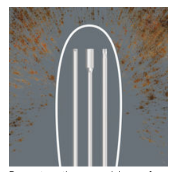
Due to the special surface treatment, the blades receive a high level of corrosion protection. The optimum fitting accuracy of the screw is also guaranteed.