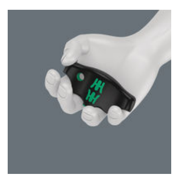
The ergonomically shaped 2-component T-handle with finger recesses and pleasant surface facilitates very high power transmission and fatigue-free working.

Further versions in this product family: