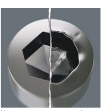
Hexagon screws can endure a problem because the contact surfaces delivering the power from the conventional tool, is transferred to the screw via very small surface areas. The consequence: the screw can become damaged (rounding out). Hex-Plus tools have a greater contact surface that prevents this from happening! At the same time, as much as 20 % more torque can be applied. Good to know: Hex-Plus tools fit into every standard hexagon socket screw!