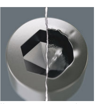
Hexagon screws can endure a problem because the contact surfaces delivering the power from the conventional tool, is transferred to the screw via very small surface areas. The consequence: the screw can become damaged (rounding out). Hex-Plus tools have a greater contact surface that prevents this from happening! At the same time, as much as 20 % more torque can be applied. Good to know: Hex-Plus tools fit into every standard hexagon socket screw!