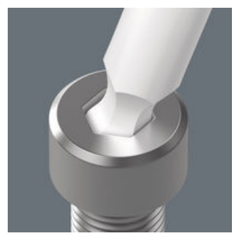
The spherical drive profile means that it is possible to swivel the axis of the tool to that of the screw, and therefore enable angled, "around-the-corner" screwdriving jobs.

L-keys made from circular material fit into the hand better and allow less strenuous work over a longer period. Additionally, the rubber sleeve provides a pleasant grip, particularly in applications at low temperatures. Colour coding and large stamp enable the desired Lkey to be easily located. Moreover, the round material keys are more robust, particularly where smaller sizes are concerned.