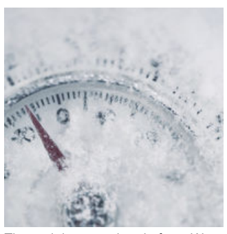
The stainless steel tools from Wera are vacuum ice-hardened and have the hardness and strength needed for screw connections. There are no limitations to the industrial applications they are suitable for.