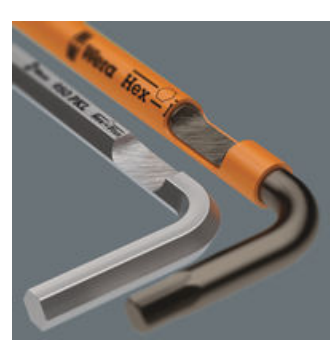
L-keys made from circular material fit into the hand better and allow less strenuous work over a longer period. Additionally, the rubber sleeve provides a pleasant grip, particularly in applications at low temperatures. Colour coding and large stamp enable the desired Lkey to be easily located. Moreover, the round material keys are more robust, particularly where smaller sizes are concerned.