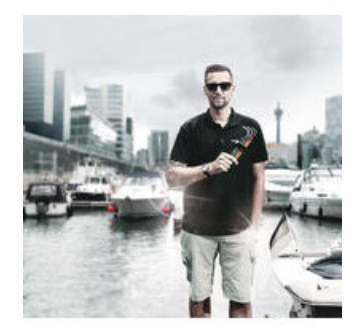
We questioned the classic L-key design, since all too often the screw head recess is rounded out, meaning screws can no longer be tightened or loosened - and so the user finds the L-key slipping out of the recess. Wera Hex-Plus tools have a larger contact surface in the screw head. The notching effects are reduced and thereby the deformation of the screws. At the same time, as much as 20 %more torque can be applied.