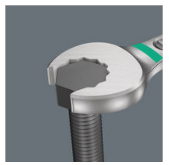
The double hexagon geometry on the open end and ring sides secures the positive connection with the screw head or bolt and reduces the risk of slipping.