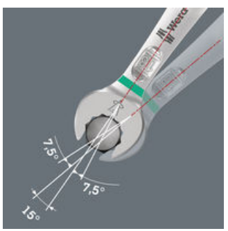
Joker 6003: For return angles of less than 30°

Thanks to the open end side offset by 7.5°, double hexagon geometry and an adjusted application method (placement - screwdriving - turning - replacement - screwdriving - turning, etc), even screwdriving challenges allowing a return angle of less than 30° can be solved.