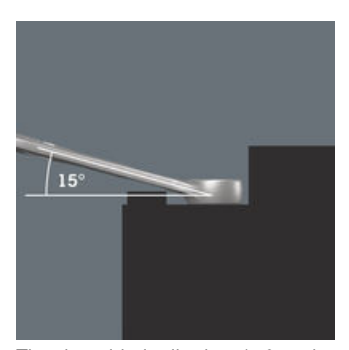
The ring side is tilted at 15° to the tool axis to prevent injury.