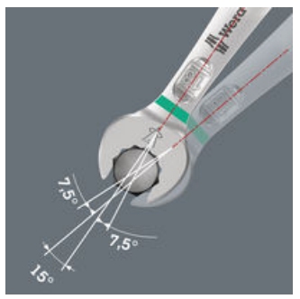
Joker 6003: For return angles of less than 30°

Thanks to the open end side offset by 7.5°, double hexagon geometry and an adjusted application method (placement - screwdriving - turning - replacement - screwdriving - turning, etc), even screwdriving challenges allowing a return angle of less than 30° can be solved.