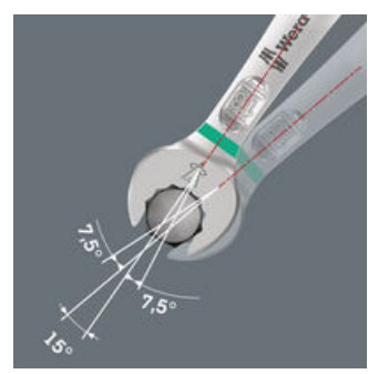
Joker 6003: For return angles of less than 30°

Thanks to the open end side offset by 7.5°, double hexagon geometry and an adjusted application method (placement - screwdriving - turning - replacement - screwdriving - turning, etc), even screwdriving challenges allowing a return angle of less than 30° can be solved.