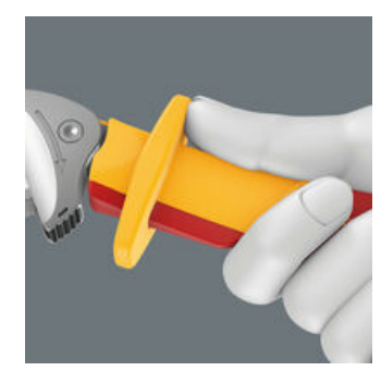
The anti-slip protection at the front end of the handle ensures a secure hold and prevents your hand from accidentally slipping forward.