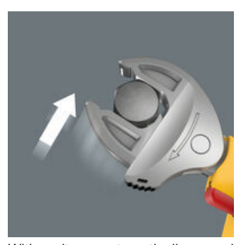
With its automatically and continuously gripping parallel jaws the Joker 6004 VDE spanner covers all dimensions within the potential operative range. The tool finds the required size by itself when attaching it to the bolt or screw.