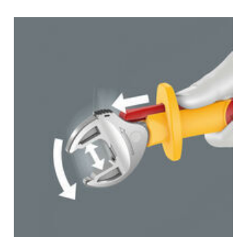
The sliding function allows contactless and safe opening of the non-insulated jaws.