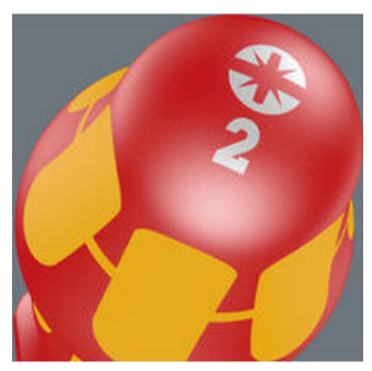
The screw symbol and tip size identification markings on the handle make it easier to find the right screwdriver in the tool case, or at the workplace.