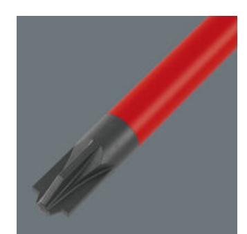
For the use in terminal blocks, control cabinets, switches, relays, sockets etc.