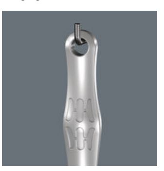
Thanks to its hole the Joker can be neatly hung on the workshop wall.