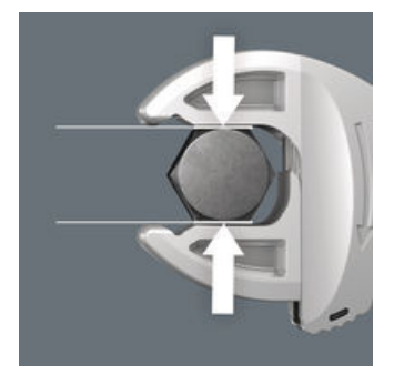
Joker 6004: Gentle to the screw

The parallel smooth jaws of the Joker 6004 allow surface pressure and can thus prevent rounding of the bolt or screw head, which can occur during power transmission on corners.